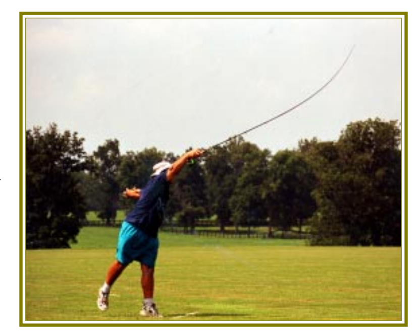
Top: BGSL's casting pools are superb; Below: Distance casting events take place at the polo grounds.

This ACA rate is US $89 per night plus 12.36% tax (1-5 persons per suite at no extra charge). There are suites with a king size bed and a couch and suites with two double beds and a couch.