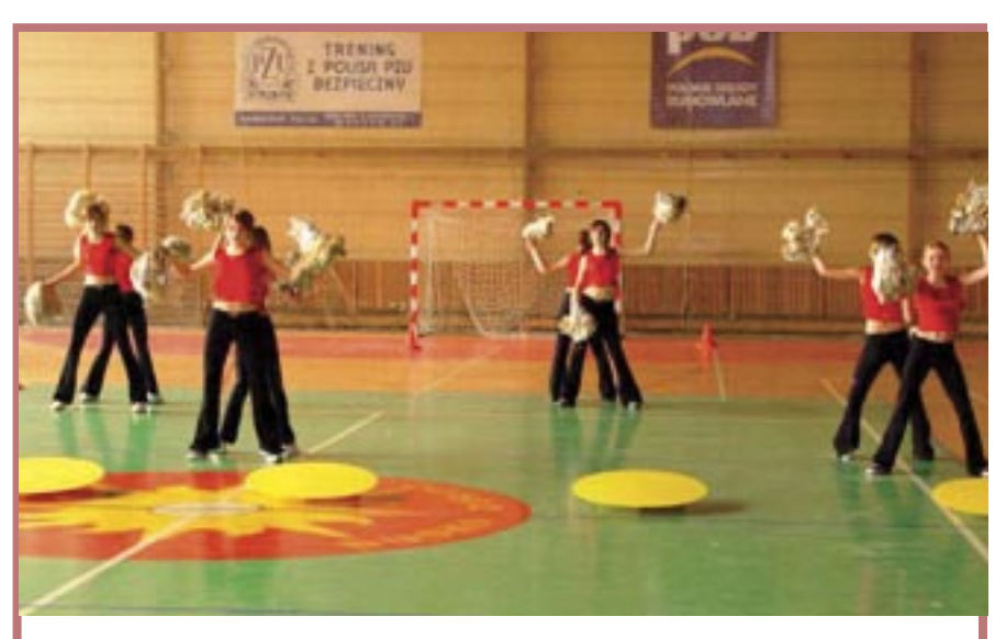
Here's a novel approach that was used in Polish high schools: Cheerleaders for indoor casting. Note that targets (yellow) are slanted for better visibility. When a plug hits the wooden targets, because of the sound, there is no doubt between a perfect and a miss. SIS-BOOM-BA!

we could drop the 3/8 oz. without losing a beat. As it stands now, so many people are using the same rod for both events, it is kind of redundant. Something to look at.