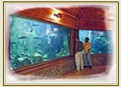
Cabela's spectacular dining room and aquarium.