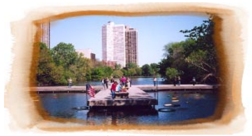
The Creel/Fall 2003/Page 4